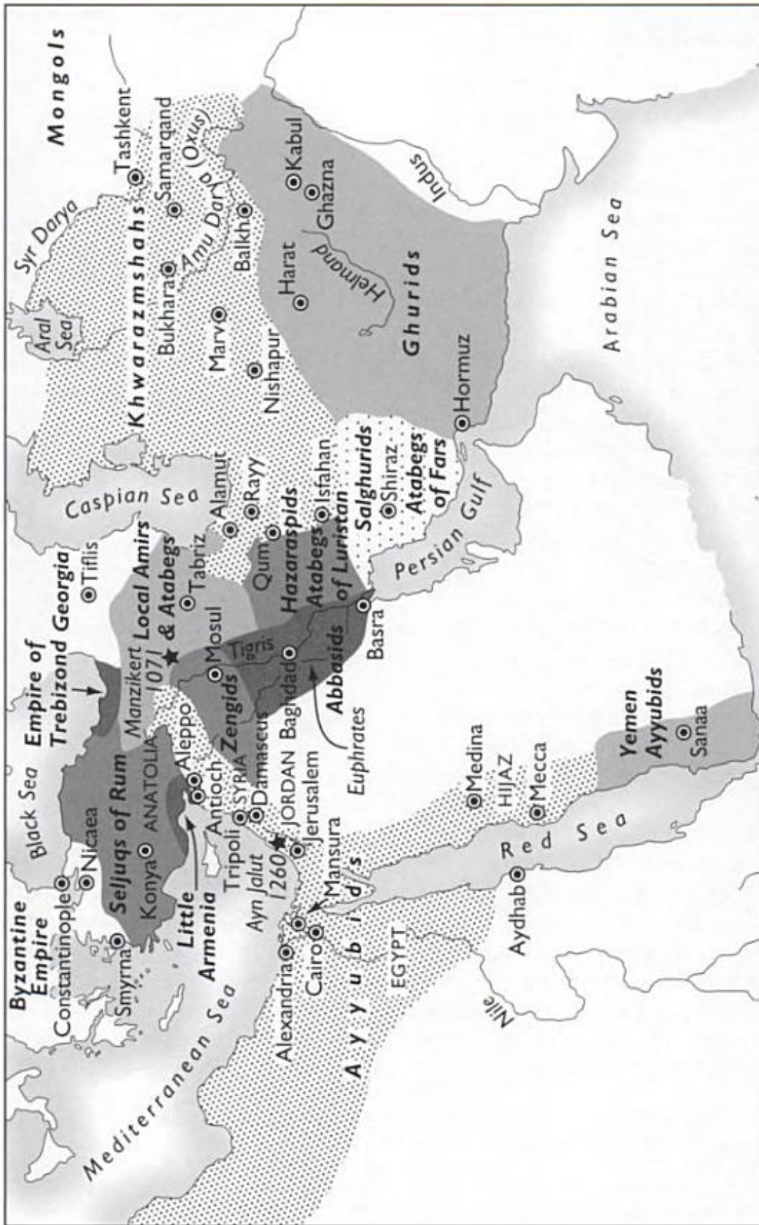
Map 2 The Islamic commonwealth of states in the middle of the thirteenth century